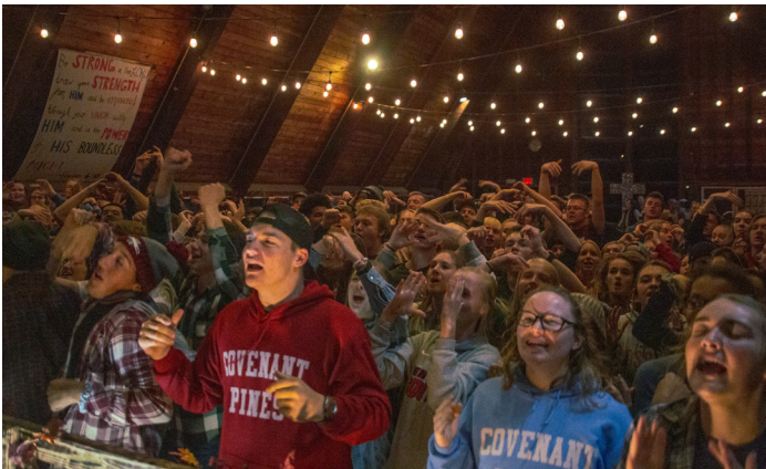
Our Chapel has served as a space of spiritual nourishment, growth and calling.

The chapel is sacred space for so many who have made next faith steps within the walls. With that in mind, decisions regarding the existing chapel will be made in the upcoming years. No plans are imminent.