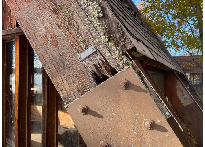
Our 64-year-old Chapel has structural issues.

Imagine campers and retreat attendees missing opportunities to take their next step in faith because of distractions caused by spaces that aren't designed for worship or are too crowded, too hot, too noisy, or too far from the bathroom.