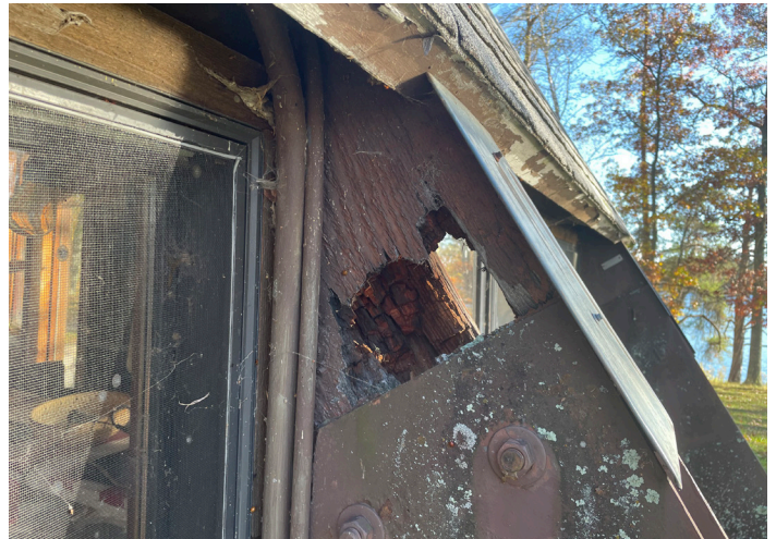
The deteriorating condition of the Chapel is moving us to action.

“As a youth pastor, retreats at Covenant Pines are golden opportunities for me to grow deeper in my relationships with students. Since the camp staff takes care of the programming details, I get to give my full attention to simply being present, and investing my energy in quality time with kids-- which is often where the most important moments and life-altering conversations happen! When our group spends a weekend at camp, we come away closer to one another and to God, ready to take the next steps of faith in our daily rhythms. Retreats at CPBC are a HUGE asset to our ministry!”