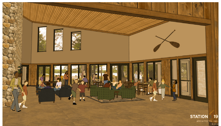
Architect rendering of the Commons.