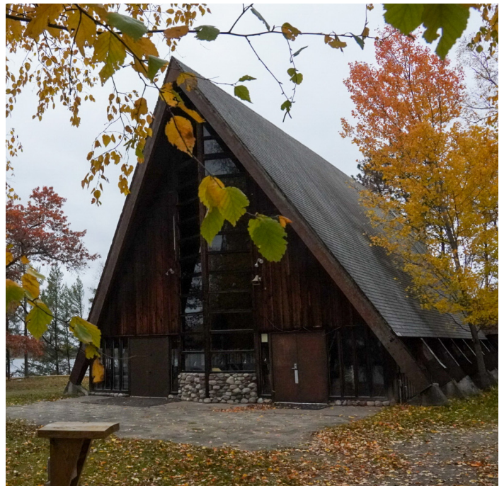
Our beloved Chapel built in 1957