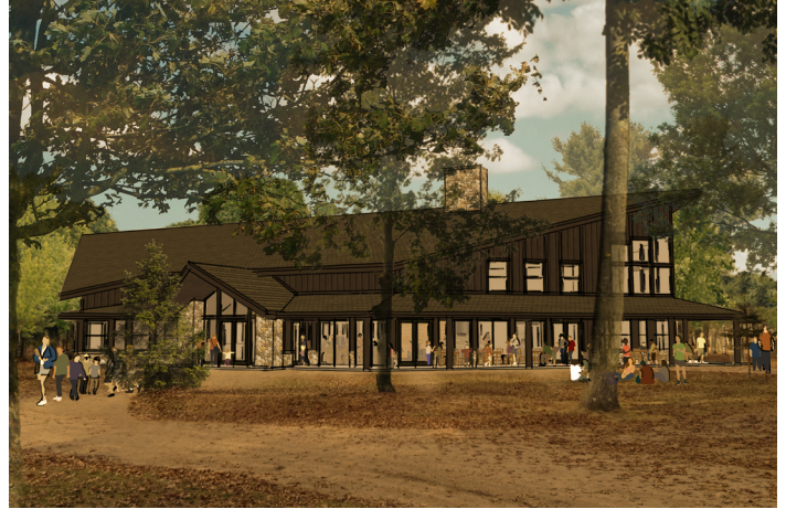
Architect rendering of the front of the new building with our existing trees as seen from the playground.

For decades, the chapel experience has been the number one rated activity at camp. It is the “heart of camp.” The proposed location of the Worship Center will physically represent the “heart of camp” with its location near the middle of our property. We are prohibited from rebuilding on the current site of the Chapel, due to shoreline setback requirements.