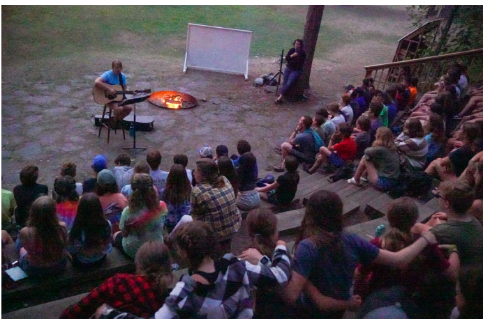
Outdoor worship in the amphitheater.